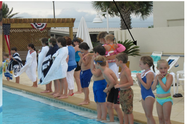
QUARTER DIVE is a long STANDING Tradition...